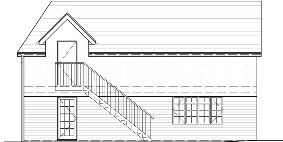
Side Elevation 1